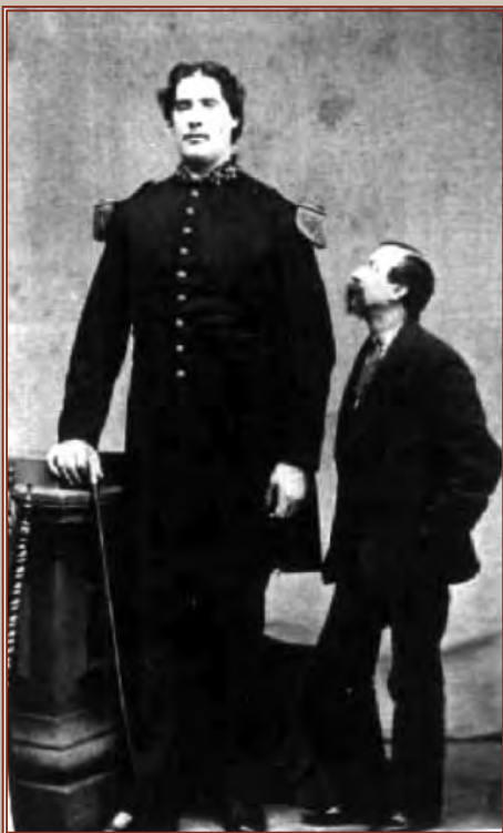
A glandular condition caused Martin Van Buren Bates to stand more than 7 feet tall, weighing 478 pounds by the time he was 21 years old.