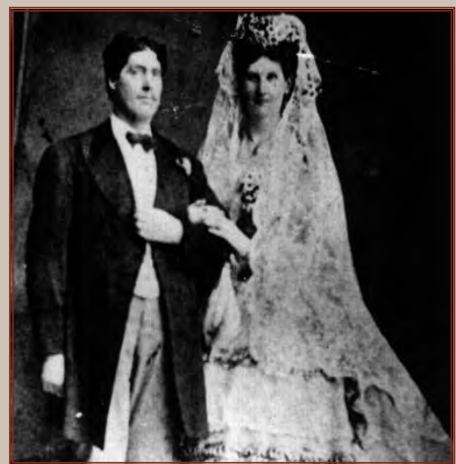
Martin Van Buren Bates married Anna Swan on June 17, 1871.

Martin wore a black suit that displayed the large jeweled watch Her Majesty had given him at their first meeting. Each of them had received a watch said to have been the size of a saucer adorned with diamonds and other jewels and a 6-foot long gold chain attached. Each watch was valued at $1,000.