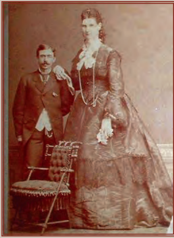
By the age of 17, Anna Swan stood nearly 8 feet tall.

birthday, she stood 4 feet 6 inches. Two years later, she stood 5 feet 2 inches — nearly as tall as her mother. On her 11th birthday, Anna was 6 feet 2 inches tall and weighed 212 pounds. Four years later, she was more than 7 feet tall. By her 17th birthday, she had reached her full height of 7 feet 11 inches.