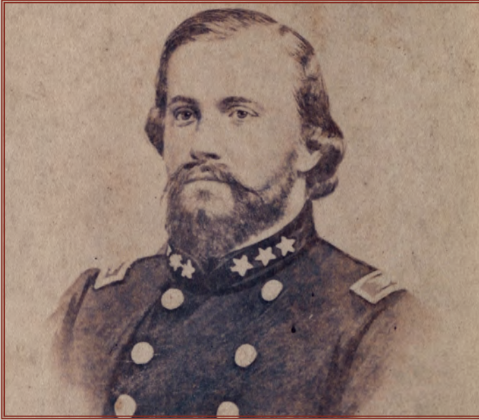
Many of the Civil War battles Martin Van Buren Bates participated in were part of the command of Lexington's General John Hunt Morgan.

nominee and won the national election. The question of slavery had been an issue for years, and Kentuckian Henry Clay was famous for his efforts to hold the nation together. His compromises in 1820 and 1850 had held both sides of the slavery question in check. But now the south felt a new threat from a new leader of a new party.