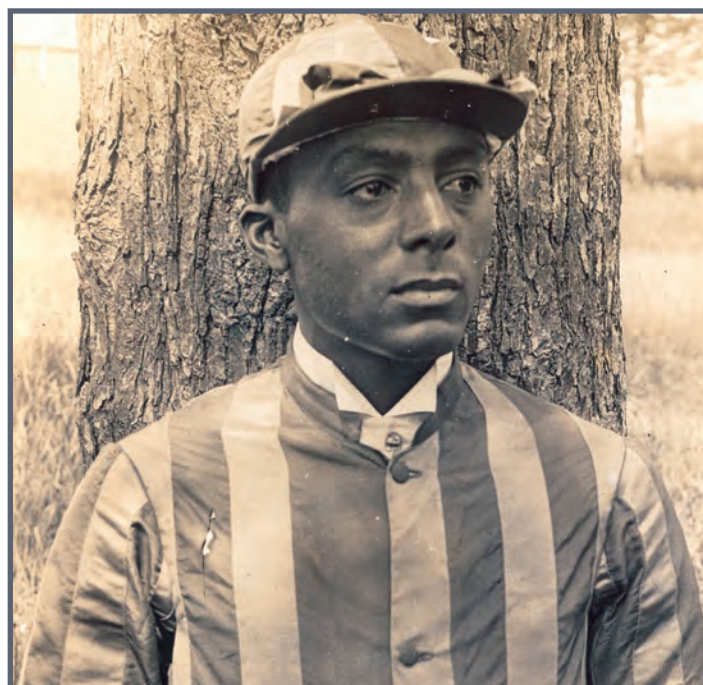
Isaac Murphy claimed victory at the Kentucky Derby three times — 1884, 1890, and 1891.