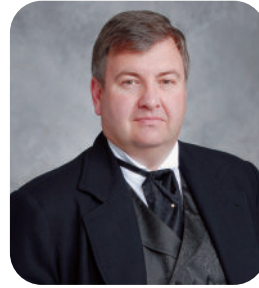
Justice John Marshall Harlan The Great Dissenter