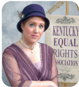
Madeline McDowell Breckinridge "Votes for Women!"