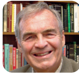
Jim Claypool Songs of Kentucky's Civil War