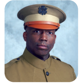
Colonel Charles Young Bridge Builder